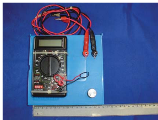
Figure 1 - Small iontophoresis device

A portable, small (15 x 15 x 6 cm) iontophoresis device (Figure 1) was designed and built by the Bioengineering Division of the Heart Institute InCor, São Paulo, Brazil. On its control panel, a knob sets the DC current applied to the skin, and an ammeter displays its value. Internal batteries power it. The electronic diagram of this device is shown in Figure 2. Stainless steel electrodes that are smaller than usual (6-10 cm 2 ) were manufactured for our application. Porous tissue dampened with 2% pilocarpine hydrochloride and with saline are respectively