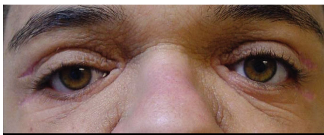
Figure 3 - Final results after 1 year. Lateral canthal suspension provided a better lower eyelid position because it pulled and suspended its components, and it especially stabilized the lower eyelid with the orbit periosteum