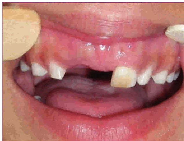
Figure 1 - Clinical aspect of patient with Hypophosphatemic Rickets.

We were unable to detect a significant correlation between the presence of dental abnormalities (radiographic abnormalities, hypoplasia and malocclusion) and delayed treatment or poor compliance (stature z-score \leq -1,9 ) ( p > 0,05 ).