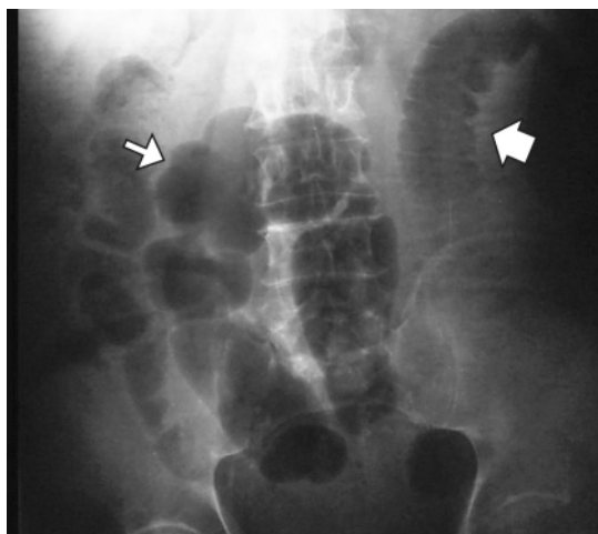
Figure 1 – Radiograph of the abdomen in the supine position, showing the distension of the jejunum flaps (narrow arrow) and “pile of the coins” sign (wide arrow) – both signs of intestinal obstruction.

On the same day, the patient presented an episode of melena and extensive painful ecchymosis on the upper limbs.