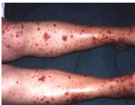
Figure 2 - Palpable purpuric lesions on the lower limbs

Only two of our patients presented joint involvement, which corresponds to data published from other series. 6 In addition, four of them had nephropathy (Table 1). Our patients with renal involvement presented with dysmorphic hematuria and non-nephrotic range proteinuria in three cases. Serum creatinine levels were high in two of the patients. Kidney involvement usually determines the prognosis; 7 although the most frequent histological finding is mesangial proliferation, 8 lesions range from minimal change to severe