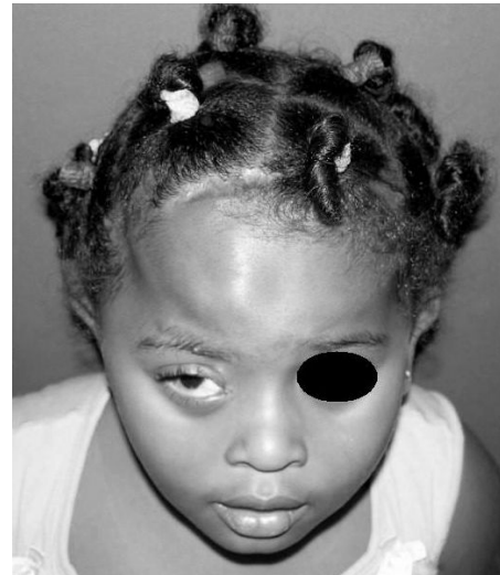
Figure 5 - Post-operative results