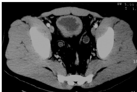
Figure 2 –Pelvic computed tomography revealing diffuse bladder wall thickening and bilateral ureteral wall thickening and dilatation

and dilatation up to the ureterovesical junction (Figure 2). Cystoscopy revealed a polypoid mass in the vesical trigone and prostatic urethra with an inflammatory aspect. The ureteral orifices were completely obstructed and therefore impossible to identify. An incomplete transurethral resection (TURB) of the lesion was performed. Histological study revealed chronic CG with the formation of an inflammatory polyp.