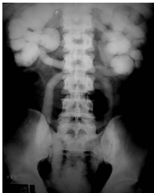
Figure 1 – Intravenous urography showing bilateral ureterohydronephrosis and delayed contrast excretion. (150 minutes)

Urinary ultrasonography revealed a thickened bladder wall and a polypoid mass in the vesical trigone and prostatic urethra. Intravenous urography showed severe bilateral hydronephrosis and delayed contrast excretion (Figure 1). Computed tomography (CT) confirmed the thickening of the bladder wall and revealed bilateral distal ureteral thickening