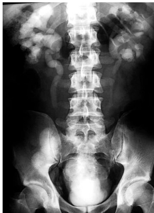
Figure 4 - Intravenous urography, at the 6-month follow-up, showing normal contrast excretion and marked reduction of ureterohydronephrosis