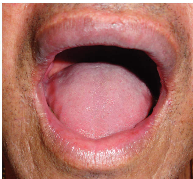
Figure 5 - Cosmetic results satisfactory