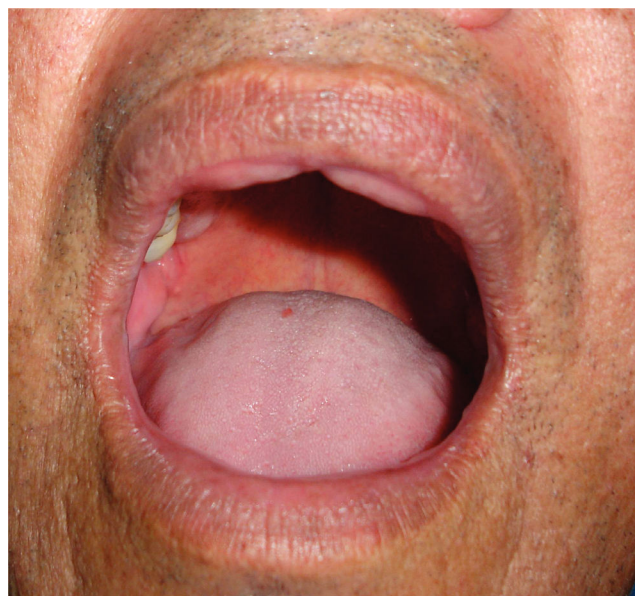
Figure 1 - Double upper lip

local anesthesia (Figure 2). The incision was subsequently sutured (Figure 3).