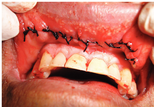
Figure 3 - The "accessory" lip removed and sutured

Clinical examination of our patient revealed marked ptosis of the upper eyelids bilaterally, presumably due to