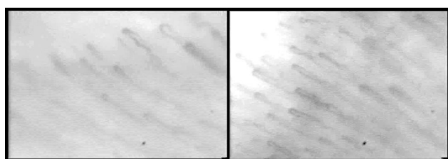
Figure 1 - Visualization of functional capillary density before and after venous congestion, showing the increase in the number of capillaries. The results were obtained for a normotensive subject

We used a miniature blood pressure cuff applied to the base of the left fourth finger inflated at 60 mmHg for 3 minutes. We visualized the capillaries for 30 seconds during the occlusion at the central field, which was previously analyzed for baseline functional capillary density. Estimated structural capillary deficit was calculated as the percentage of discrepancy of the functional capillary density between the hypertensive and normotensive subjects after the venous congestion response (Figure 1).