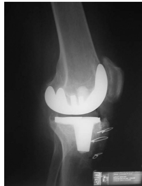
Figure 3 - Total arthroplasty without posterior stabilization and without replacement of the patella, after six years of clinical course