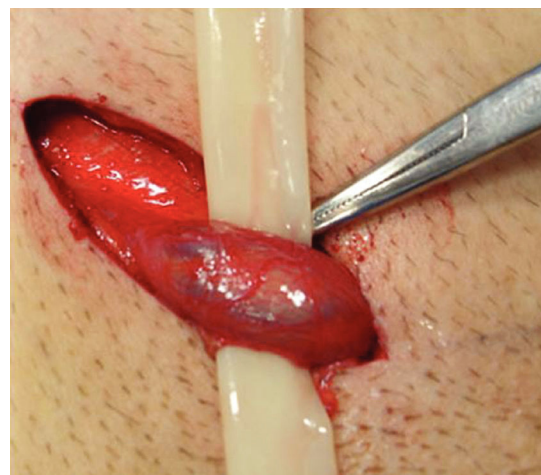
Figure 3 - Spermatic cord dissected and repaired