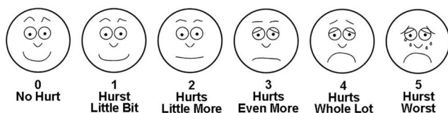
Figure 1 - Wong-Baker FACES Pain Rating Scale

Our chosen clinical approach involved sequentially assigning simple and then increasingly more complex types of treatment without discontinuing previous regimens. These included the administration of commonly used analgesics, anti-inflammatory drugs and opioids, scrotal suspensory and/or corticoid injections in the spermatic cord, and the administration of tricyclic antidepressants. Psychological support was mandated after administering the antidepressants, and acupuncture was the last therapeutic resource employed. The pain intensity was controlled through the “Wong-Baker FACES Pain Rating Scale” (Figure 1), which ranked the pain from 0 to 5. The patient’s self-report was recorded and classified as worse, the same or better in comparison with the pain referred before the last consultation.