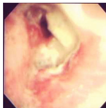
Figure 1 - Endoscopic image of necrosis in the bronchial anastomosis

days, and the total length-of-stay was 28 days. Initial immunosuppressive therapy included tacrolimus, prednisone and azathioprine, substituted 14 days later with mycophenolate mofetil, due to leukopenia. Prophylaxis against Cytomegalovirus and P. carinii was provided by treatment with ganciclovir and co-trimoxazole. The patient developed significant inflammatory infiltration in the left lung on the 14 th postoperative day. Transbronchial biopsy showed minimal rejection (grade A1) of the transplanted lung, and the patient was treated with methylprednisolone resulting in total recovery. A bronchoscopic evaluation also showed partial necrosis at the anastomotic site, but no signs of dehiscence (Figure 1).