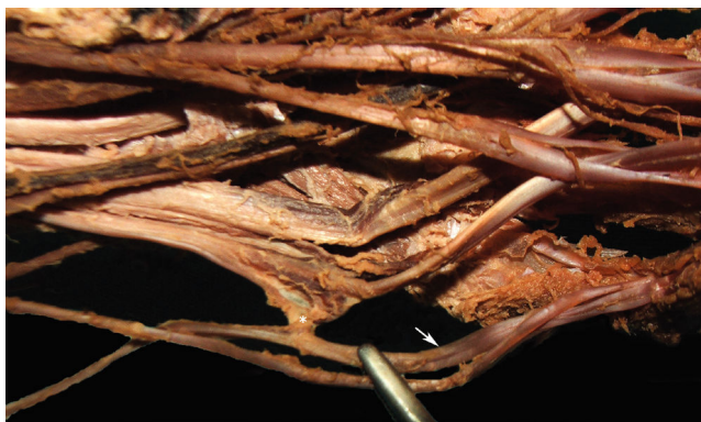
Figure 2 - Close view of the connection between the anomalous tendon and the FDP tendon to the ring finger. The white arrow indicates the FDP tendon originating from the FDS muscle, and the white asterisk indicates the intertendinous connection