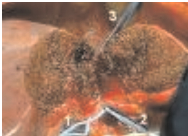
Figure 3 - Anterior approach to the liver for resection of the paracaval portion of the caudate lobe. Isolation of the portal pedicle (1, 2) and supra-hepatic inferior vena cava (3)

direct view, facilitating control of venous bleeding and the interruption of the ascending paracaval portal branches along the hilar plate (Figures 2 and 3).