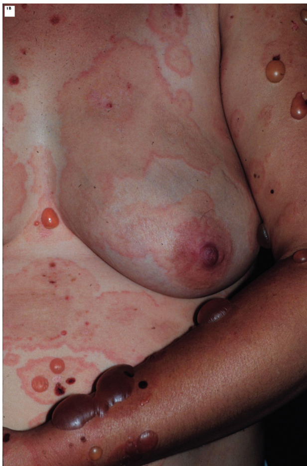
Figure 1 - Pemphigoid Gestationis: Pruritic urticarial lesions and tense blisters on the trunk

Seven cases of PG were diagnosed in our department between 1996 and 2008, and the patient age ranged from 19 to 39 years (mean, 30.3 years). Disease onset was reported in the second trimester of pregnancy in four patients and in the third trimester of pregnancy in three patients. One patient had a flare up of symptoms during the puerperium. Main sites of involvement were lower limbs (mainly thighs), forearms, trunk, and abdomen (Figure 1). One patient had