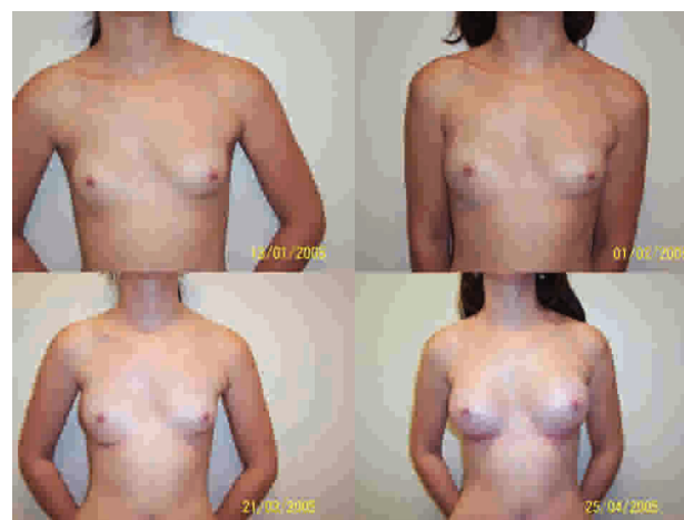
Figure 6 - A patient with Poland's syndrome on the right side. Nineteen days after the omentum flap transposition, it is possible to see the beginning of the omentum's growth in the lateral portion of the breast. Two months after omentum flap transposition only, the right breast had doubled in size, becoming bigger than the left breast. In the last picture, the right side has received a 200 cc high-profile implant while the left side has received a 225 cc low-profile implant.

hospital stays, fewer complications, and a faster return to normal life when compared with open procedures. 9-15