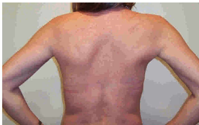
Figure 1 - A latissimus dorsi flap deformity of the right side. Although subtle, this difference can be very uncomfortable when wearing certain clothes.

Various options have been proposed to restore the breast's volume, including expanders and implants, transposition of the latissimus dorsi muscle flap (when unaffected by the syndrome), and use of the rectus abdominis muscle flap when the latissimus dorsi is absent. 5-8 While these techniques may achieve excellent results depending on the degree of deformity, satisfaction with the aesthetic reconstruction of the anterior axillary pillar and the filling of the infraclavicular depression has been low. 5 Moreover, the use of those muscular flaps generates an additional scar in the patient's donor region. In addition to a scar, removal of the latissimus dorsi flap also leaves an additional deformity in the dorsal contour due to the absence of muscle filling the posterior axillary pillar. In addition to being unsightly, it can be very uncomfortable when wearing certain clothes (Figure 1).