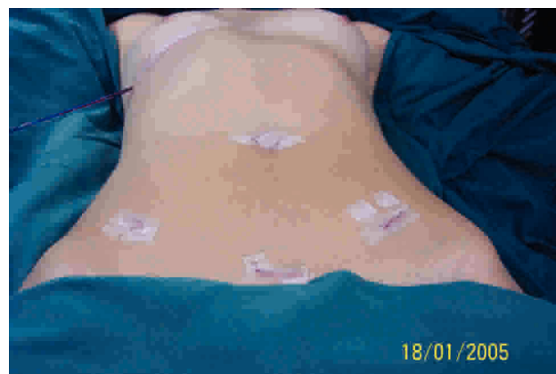
Figure 2 - Four ports are usually used to harvest the omentum flap.

The procedure to harvest the omentum flap is performed using standard laparoscopic surgery techniques. Four ports are placed as usual, and a CO 2 pneumoperitoneum of 8-10 mmHg is maintained during the procedure (Figure 2). Dissection of the flap is initiated by clamping and elevating the gastric wall. The right gastro-epiploic artery is isolated and preserved; ligations of the short gastric arteries along the greater curvature are then performed until the left gastro-epiploic artery is reached. The omentum should be disconnected from the transverse colon by a