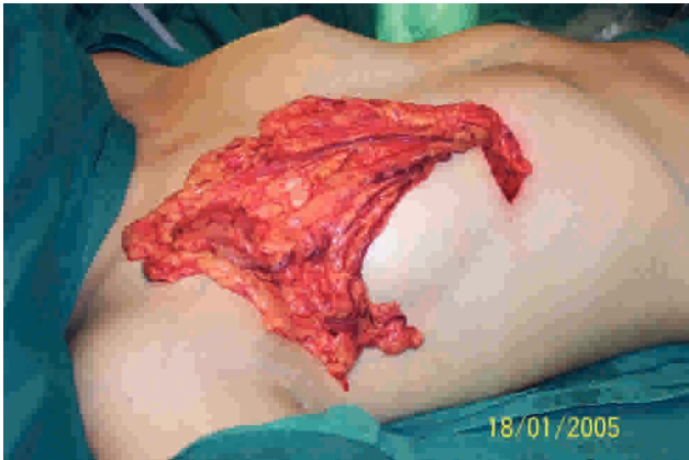
Figure 4 - The omentum flap on the thoracic wall.

Age, gender (M/F), side of the syndrome, use of complementary prosthesis in the breast, and time required