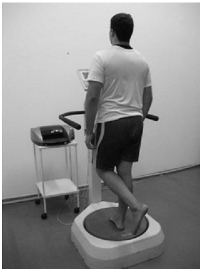
Figure 2 - An athlete performing the platform stability test.

athlete was positioned with his arms parallel to the longitudinal axis of the body while keeping his hand in contact with his thigh. The subject was instructed to keep his eyes open and fixed on a point on a white wall 1 meter from the equipment, and his knees were bent 10^{\circ} to 15^{\circ} while keeping his hips in a neutral position. After the three tests, the device software reported the stability index based on the degree of oscillation of the platform during the evaluations.