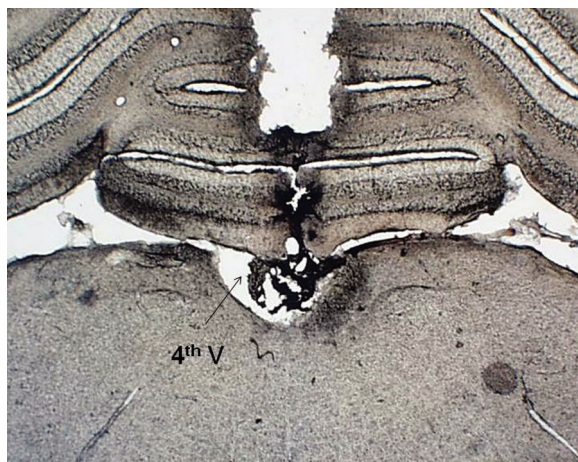
Figure 1 - Histological image of a rat brain coronal slice showing the medulla and cerebellum (~13 mm caudal to bregma). V4: fourth cerebral ventricle.

alteration is not higher than the difference between vehicle and ATZ groups at 60 minutes: ATZ 106(113–119 mmHg or 5.0%) vs vehicle (101–106 mmHg or 5.1%) groups.