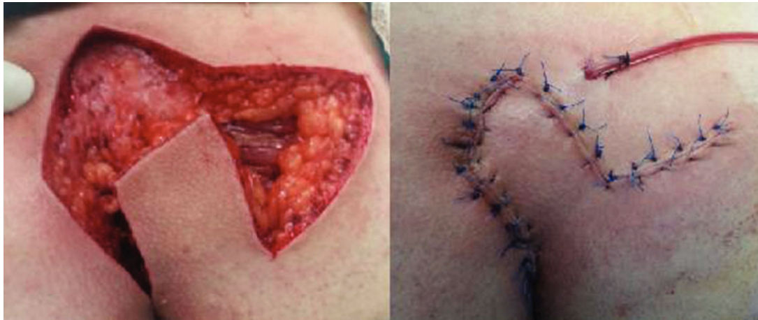
Figure 2 - Limberg flap technique.