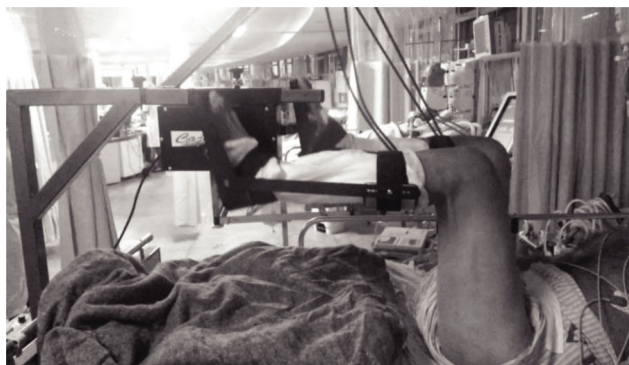
Figure 1 - Illustration of passive cycle ergometer application on lower limbs in critical patients under mechanical ventilation.

plate are added, resulting in the complex Bc-Ag-Ac-enzyme (sandwich technique). A second wash is performed for the removal of unlinked antibodies. Then, a substrate is added that has the property of assuming a different coloration when in contact with the enzyme; this colour is proportional to the amount of mediator present in the sample (antigen). The reading is obtained in a plate reader (Bio-Rad, Tokyo, Japan) at 450 nm and compared to a standard curve obtained with known concentrations of recombinant mediators.