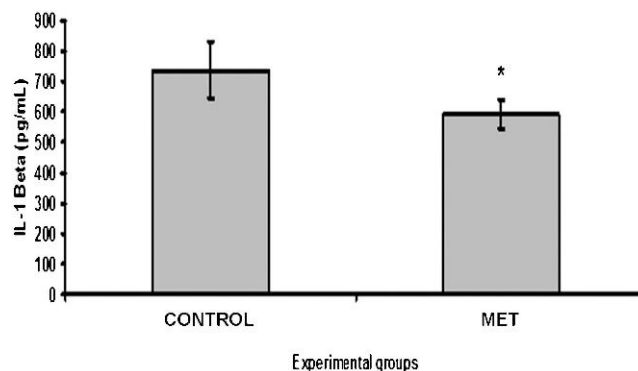
Figure 2 - Pulmonary interleukin-1 beta assay. After transplantation, there was a significant decrease in the levels of interleukin-1 beta in the methylprednisolone group compared with the control group (* p=0.0155 ). The values are expressed as the mean ± standard error of the mean.