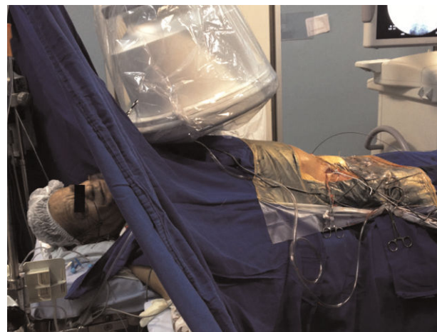
Figure 1 - Image shows an awake patient being treated for a ruptured aneurysm under local anesthesia.

The other 16 EVAR cases were treated with bifurcated endografts. Contralateral gate cannulation and a complete endovascular procedure were possible in all patients. Furthermore, aneurysm exclusion, which was evaluated on the angiogram and performed at the end of the procedure, was achieved in 100% of cases in the endovascular group. No patient required emergent conversion of bifurcated stent grafts to AUI devices or open surgery.