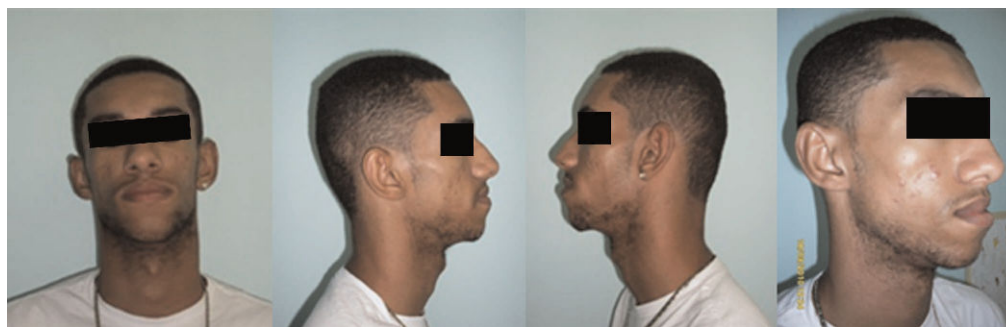
Figure 1 - patient with facial lipoatrophy associated with HIV.

Treatment Center that offers free and universal access to antiretroviral therapy. The participants were eligible if they met the following criteria: received a medical diagnosis of HIV acquired through mother/child transmission; were receiving continuous retroviral therapy; presented an undetectable viral load; did not previously receive PMMA infiltration treatment; scored six or less points on the Facial Lipoatrophy Index (FLI) (6); and presented no history of head and neck trauma or surgery. According to Brazilian legislation, although the use of PMMA for treating facial lipoatrophy associated HIV is indicated for individuals above 12 years of age, there is a national consensus that this material should be used with caution in adolescents. Craniofacial development can still be observed in adolescents and can occur until the end of this phase (i.e., approximately 18 years of age) (7). The use of permanent fillers for aesthetic purposes is recommended only after craniofacial growth has ended to avoid new surgical interventions and new aesthetic procedures. Of the nine patients who were referred for facial stimulation therapy, only four completed the treatment proposal (Figure 2).