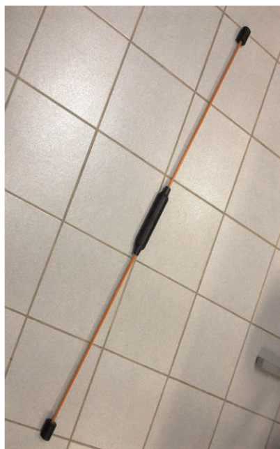
Figure 1 - Example of a flexible pole (Flexibar®) used in our study.

50-60 seconds of rest between each exercise. Three repetitions were performed for each exercise (6).