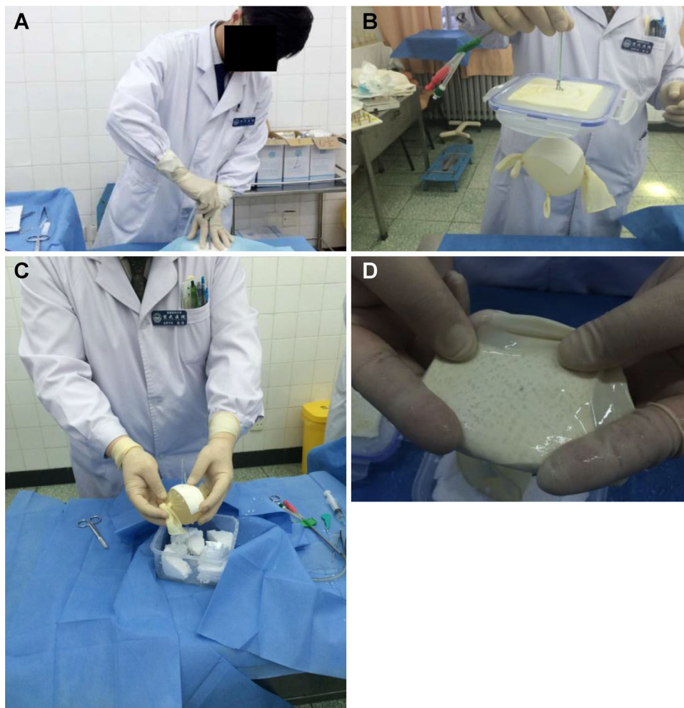
Figure 2 - Demonstration of self-made training model for suprapubic paracentetic cystostomy. Figure 2A. Suprapubic paracentetic cystostomy simulation performed by a student. Figure 2B. After puncture, the tightness of the connection between the catheter and simulated bladder is checked to rule out extravasation. Figure 2C. After puncture, the catheter is removed to observe water flow from the simulated bladder. Figure 2D. Glove used as the simulated bladder is extracted to observe the puncture hole and signs of puncture.

The trainees were fourth-year medical students who had not yet entered the clinical practice stage and had no prior patient contact. Thus, they had not received any training in clinical practice and had no prior experience with suprapubic catheter insertion or the associated bladder breakthrough during the procedure. The students were randomly divided into two groups, an experimental group and a control group, each comprising 20 students. Students in the experimental group were asked to read the English literature related to paracentetic cystostomy and modeling in advance (the reading period was the entire winter break for approximately 50 days) (13-18). These students watched the instructor's video of a suprapubic catheter insertion before they personally participated in preparing the suprapubic