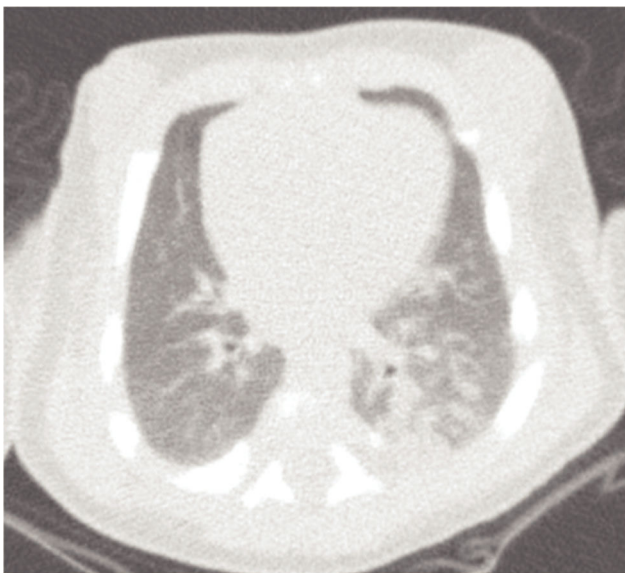
Figure 2 - JCR chest computed tomography (case 3). Multiple pulmonary opacities and sparse focus of the consolidation of bilateral multifocal distribution, with peripheral predominance and greater extension in the left lower lobe.

showed bilateral coalescent B lines on both sides of the chest (P3 classification). Chest tomography on the 7th day of the disease (19 days of life) is shown in Fig. 2. He did not require supplemental oxygen over the course of his hospitalization; he was afebrile and had an O 2 pulse saturation above 94%. He was discharged from the hospital after treatment for the urinary tract infection at 23 days of life.