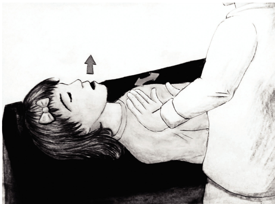
Figure 3 - Illustrative image demonstrating the forced expiration (huffing) technique associated with accelerated expiratory flow. The therapist places one hand on the patient's manubrium and the other hand on the xiphoid process of the patient's sternum. Thereafter, the therapist brings the two hands together during the patient's exhalation, accelerating the outflow of air, while the patient simultaneously exhales with the glottis and mouth open, and the abdominal muscles contracted.

processing time <2h, squamous cells \leq 80\% , and at least 200 inflammatory cells per technique (15).