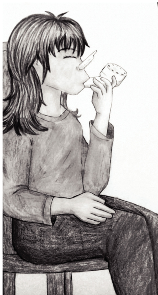
Figure 2 - Illustrative image showing a patient performing oscillating positive expiratory pressure therapy for 5 min in a sitting position.

All samples were processed according to the previously published protocol (18). Briefly, sputum was separated from