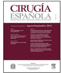
Image of the month