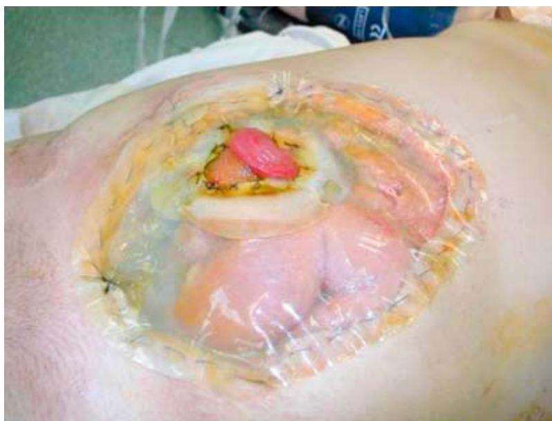
Figure 2 – Patient who suffered a blunt abdominal trauma with multiple injuries. He underwent damage control surgery that included a CL using BB and a floating stoma maturing directly on the BB. Once the vital parameters were optimised, a re-intervention was performed and the ostomised intestine was anastomosed, thus preventing a formal stoma.

clinical trial of emergency patients laparotomised due to secondary peritonitis in 7 Dutch hospitals between 2001 and 2005, it was found that those patients who underwent RLD had a lower percentage of reoperations, length of hospital stay and intensive care with respect to the PRL-treated group, thereby reducing the costs involved by 23% 8 (evidence level 2b). Furthermore, there is a systematic review of observational studies that included a total of 1266 adult patients with secondary peritonitis, which concluded that RLD showed a tendency towards a protective effect compared with PRL, regarding the hospital mortality variable. However, the heterogeneity of the studies did not allow for any definitive conclusions 14 to be drawn (evidence level 2b).