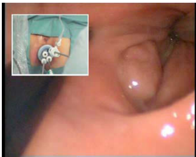
Figure 3 – Forceps and 30-degree scope inserted through the SILS device.

The classic lithotomy position was used on all patients as the lesions were located on the posterior wall.