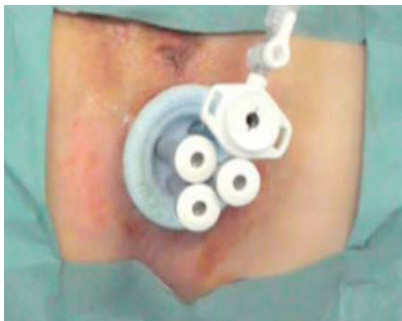
Figure 2 – SILS device inserted in the anal canal.