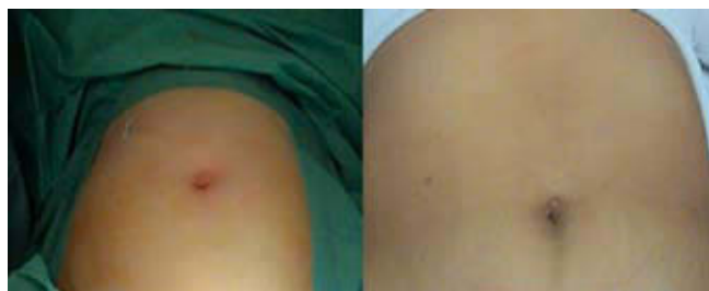
Figure 1 – Cosmetic benefit in the immediate postoperative period and one week after the operation in hybrid NOTES procedures.

Among the real benefits, which are clear despite being supported in hybrid procedures, is the reduction in trauma to the abdominal wall (Figure 1). Using a smaller number of parietal ports in the abdominal wall with a smaller diameter (3-5 mm), means less incisional pain and less possibility of parietal complications (bleeding, infection, evisceration and post-operative hernia). Performing less invasive procedures to the parietal peritoneum should also result in a reduced adhesiogenic capacity for this surgery. Some surgical approaches through natural orifices have the ability to allow extraction of surgical specimens without the