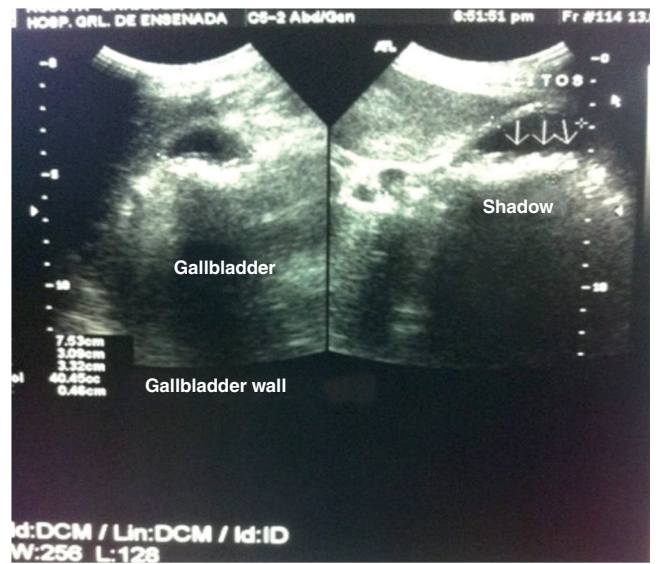
Figure 1 Gallbladder ultrasound where gallstones are visualized.