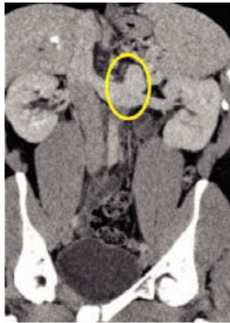
Figure 3. Computed tomography showing spontaneous splenorenal shunt.

The venous drainage of the common bile duct (CBD) is mostly by veins that ascend along its course. They form epicholedochal venous plexus and paracholedochal venous plexus. The former forms a fine reticular venous plexus on the common bile duct and hepatic ducts, and is in intimate contact with their outer surface. The paracho-