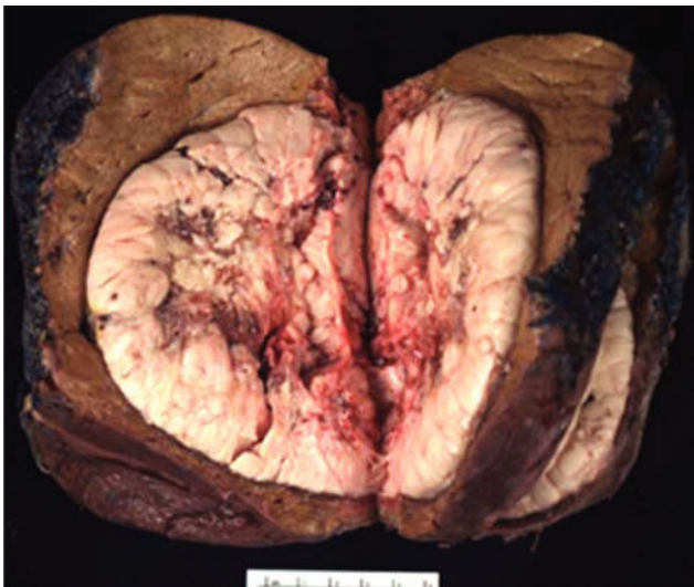
Figure 1. Photograph of resected hepatocellular carcinoma with grossly unremarkable surrounding liver.

In approximately 90% of cases, HCC develops in a background of cirrhosis. 12,13 The incidence of HCC in patients with cirrhosis depends on the underlying cause of cirrhosis and geographic origin of the patient, varying from a cumulative 5-year incidence of 30% in Japanese