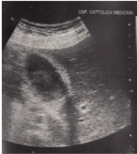
Figure 1. Abdomen US of patient.

Echocardiogram showed cardiomyopathy with severe concentric left ventricular hypertrophy. Moreover serum IgG lambda monoclonal levels were 17.3 g/l and blood tests showed: normocytic anaemia (Hb 10.3 g/dL, MCV 88), mild renal insufficiency (creatinine 1.8 mg/dL), finally, calcium levels, LDH, uric acid, microalbuminuria and urinary Bence Jones protein negatives.