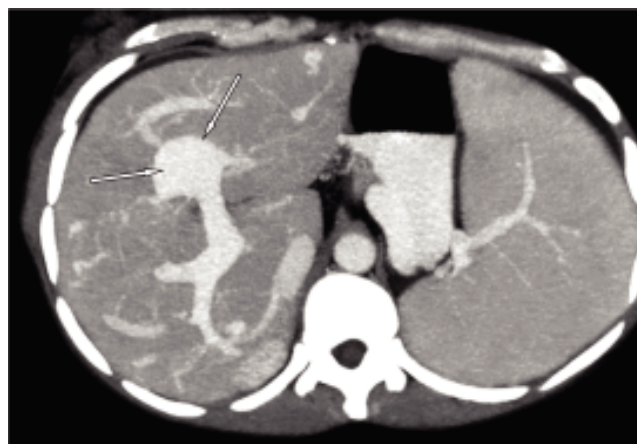
Figure 1. Contrast enhanced axial section showing aneurysmal dilatation of left branch of portal vein (arrows).

depicts the site, size, relation of the aneurysm with the vessels and its extension. 3 Color Doppler ultrasonography and magnetic resonance imaging can also depict the PVA accurately and can be used for confirming the finding. 4 CECT can also give accurate information regarding thrombosis, rupture or any other complication of the PVA. 5 Usually PVA are incidental findings, are asymptomatic and require no treatment. Serial follow up imaging can be done for assessing the PVA if needed. If the aneurysm is large or is causing symptoms due to its mass effect then it may require treatment. Medical management includes anticoagulation. Surgical management options include aneurysmorrhaphy, portocaval shunt, and mesocaval shunt. Serial imaging may be advised if PVA are stable and no complications are seen instead of going for surgical or medical treatment.