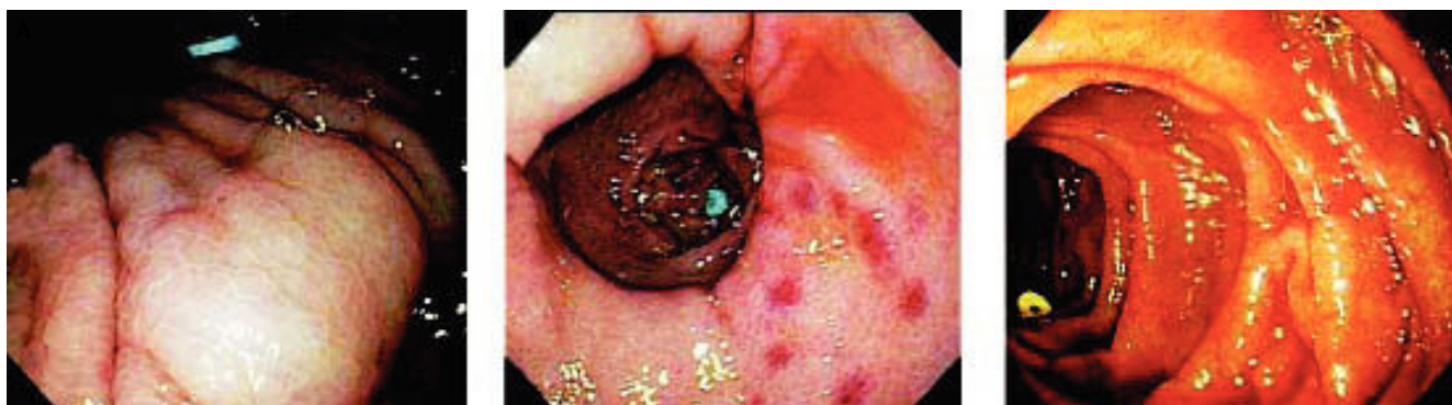
Figure 2. Three dislodged variceal bands are identified at EGD: blue band in proximal gastric body (A), blue band in duodenal bulb seen through widely-opened pylorus (B), and yellow band in descending duodenum (C). The finding of three bands still in stomach or duodenum is consistent with recent band dislodgement because of normally rapid, gastroduodenal emptying. Figure 2A also reveals a prominent, pale, snakeskin-patterned lesion, characteristic of portal hypertensive gastropathy. The proposed pathophysiology of the reported, extremely early, dislodgement of all 6 bands (< 4 h after endoscopic placement) is release of bands by stretching entrapped esophageal mucosa during esophageal balloon tamponade.

This report suggests an apparently novel complication of balloon tamponade: dislodgement of recently-placed, endoscopic bands (Table 1). If confirmed, this complication might render balloon tamponade a relatively undesirable option soon after variceal banding. A second EGD to diagnose and treat the cause of rebleeding or TIPS might generally be better alternatives in industrialized countries where these options are available. However, balloon tamponade may still be considered for severe, active bleeding if the endoscopic banding equipment or TIPS is not readily available, such as hospitals in developing countries or local, community hospitals in industrialized countries. Although one, prospective, controlled trial demonstrated that the efficacy of immediate sclerotherapy is comparable to that of