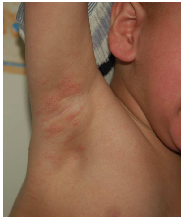
Figure 1 Demarcated pruritic erythematous papulovesicular rash with slight desquamation in right axillary region.

Upon a presumptive diagnosis of SDRIFE, the patient's antibiotic therapy (cefixime) was ended. His complete blood count, liver, and renal function tests were normal, and viral serology was negative for CMV, EBV, rubella, hepatitis A, and hepatitis B. When sent for consultation with the dermatology