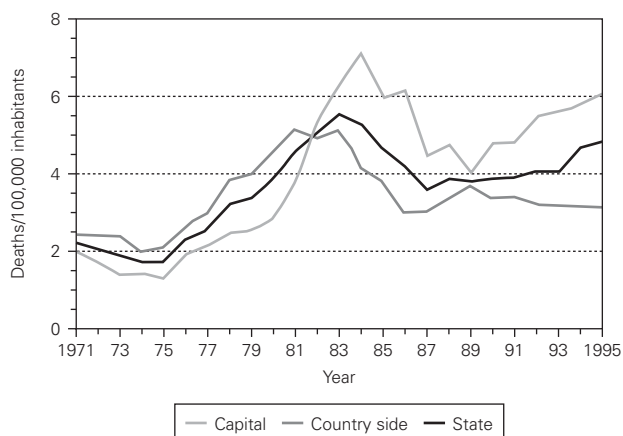
Figure 2.—Percentage of asthma deaths (9 th IDC: 493) in relation to the percentage of respiratory diseases deaths (9 th IDC: 460-519) in the age group of 5 to 34 years in the state of São Paulo (Capital and Country side): 1970 to 1996.