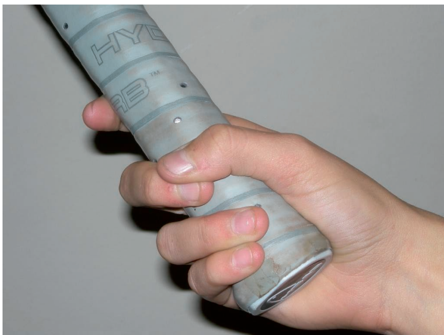
Figure 1 Image of the tennis racket grip.