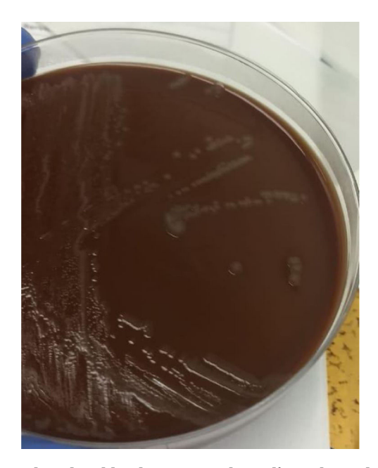
Fig. 2 – Chocolate blood agar growth medium showed the overgrowth of N. gonorrhoeae.