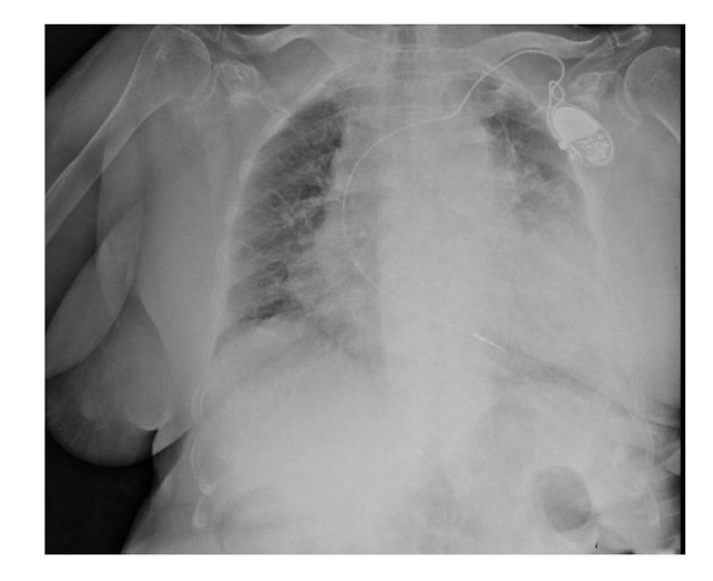
Fig. 1 – Urgent thoracic radiograph showing congestive pulmonary hilum, a small left pulmonary effusion and important cardiomegaly.

Analyzing recent studies, such as the national survey on the treatment of cholelithiasis,<sup>2</sup> an annual risk of 1%–3% was estimated for complications related to cholelithiasis due to the suspension of elective surgeries in the present pandemic situation. Many of these complications will lead to cholecystitis requiring urgent treatment. Our patient also seems to highlight the fact that there are more evolved cases,<sup>3,4</sup> perhaps for fear of in-hospital infection or delay in the consultation of symptoms or hospital access. But what also impresses us, subjectively, is the variation in the diagnostic approach in elderly patients with previous cardiorespiratory disease, where the first diagnostic suspicion now falls on SARS-CoV-2 infection if the abdominal