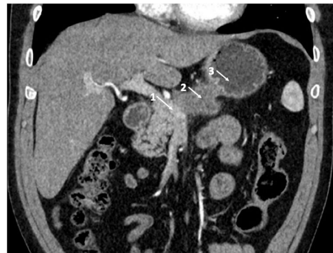
Fig. 1 – Radiological image showing the vascular infiltration: (1) splenoportal confluence; (2) pancreatic tumor; (3) gastric antrum.

In our patient, the use of the falciform ligament as a graft provided for reconstruction of the venous defect in a simple,