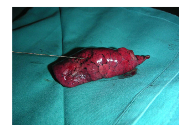
Fig. 3 – Appearance of the resected lung segment with the hook wire anchored in the PN.

52 patients were included in the study (31 men and 21 women). Mean age was 62.2 (range 28-84). The nodules had a maximum diameter of 20 mm (mean 9.57 mm). Thirty-seven nodules were <10 mm. In 6 patients, the nodule was detected during the staging of a recently diagnosed neoplasm, in 29 patients during the follow-up of a previously known neoplasm and in 17 patients there was no previous oncologic history. We placed 55 hook wires (in 3 patients, 2 hook wires were inserted simultaneously). The positioning of the hook wires was performed satisfactorily by the radiologists in the Diagnostic Radiology Unit in all cases. Fifty-two hook wires were found to be correctly anchored during the video-assisted exploration and 3 (5.4%) had become displaced. Pre-operative CT, performed immediately after the placement of the hook wire, showed minimal pneumothorax in 6 patients (11%). None of the patients presented significant symptoms and none required the insertion of a chest drain. VATS resection was performed in 50 out of the 52 patients without needing to extend the port of entry incisions. No other complications associated with the placement of the hook wire were observed (no bleeding or significant pneumothorax). Among the 35 patients with previous