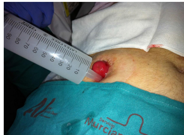
Fig. 2 – Introduction of the thickened solution via syringe.

continued follow-up visits to date, without complications or disease recurrence.