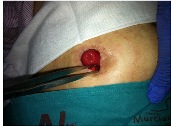
Fig. 1 – The open efferent loop orifice can be observed.

The patient had an uneventful recovery and began intestinal peristalsis 12 h after surgery, with tolerance to oral liquids in the first 24 h, and was discharged without any complications on the second postoperative day. He has