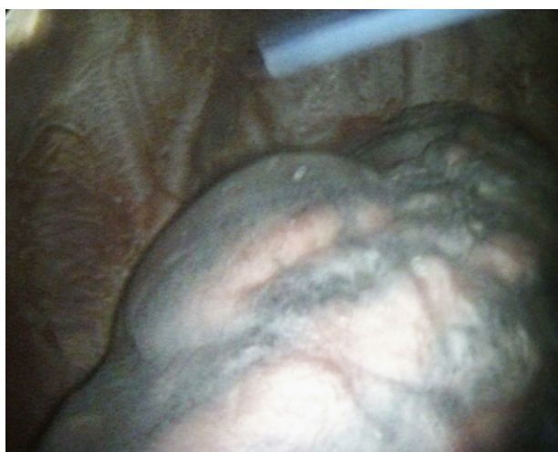
Fig. 2 – Appearance of the visceral and parietal pleura after talc application.

findings classified according to Vanderschueren staging, hospital stay, drain time, mortality, overall and specific talc pleurodesis morbidity, treatment of complications and number of recurs and their treatment. Computed tomography (CT) of the chest and pulmonary function tests (PFT) were performed at follow-up for patients who showed some respiratory symptoms or alterations in the simple chest radiography, which led to restrictive lung disease being suspected.