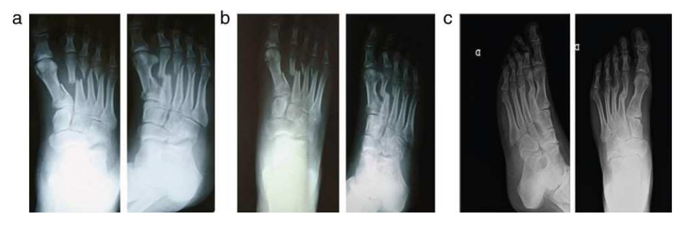
Figure 3 Fracture of metatarsals I, II, III and IV of the right foot treated with the functional method. (a) Simple radiological study at 7 days of evolution; (b) simple radiological study 2 months after the accident; (c) simple radiological study 13 months after the accident.