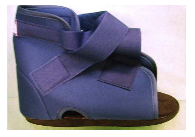
Figure 1 Stiff-soled shoe.

effective weight-bearing before 3 weeks after injury; those with concomitant diseases that lengthened the process; patients with open grade II or III fractures; and those with delayed diagnosis because the fracture was not recognised.