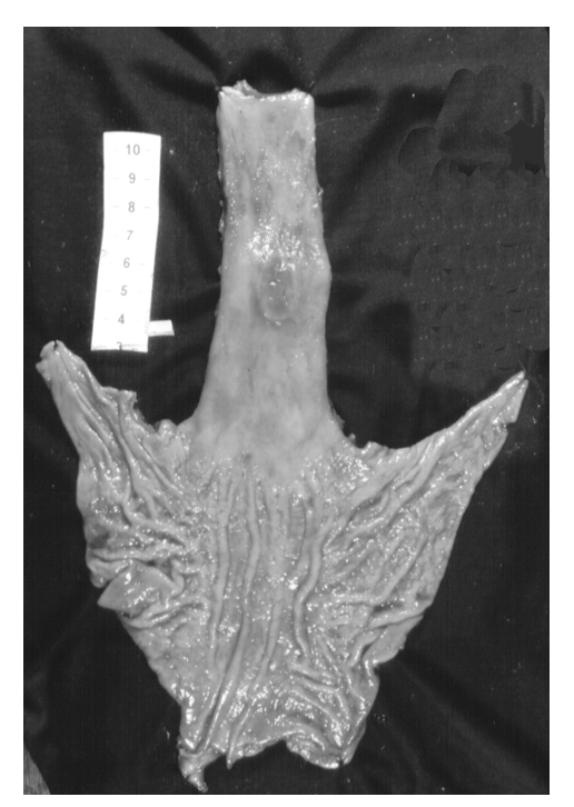
Figure 1 - Undifferentiated adenocarcinoma in Barrett's esophagus with 10.7 cm, 5.5 cm distant from gastroesophageal junction.

mal limit of the tumors and the columnar-squamous transition (Dist. Tu-Tepit) ranged from tumors reaching the epithelium transition (Tepit) to some 3.5 cm away from Tepit (mean 1.30 cm). Eight tumors (61.5%) were located less than 1.0 cm from Tepit.