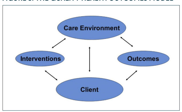
FIGURE 3. THE QUALITY HEALTH OUTCOMES MODEL