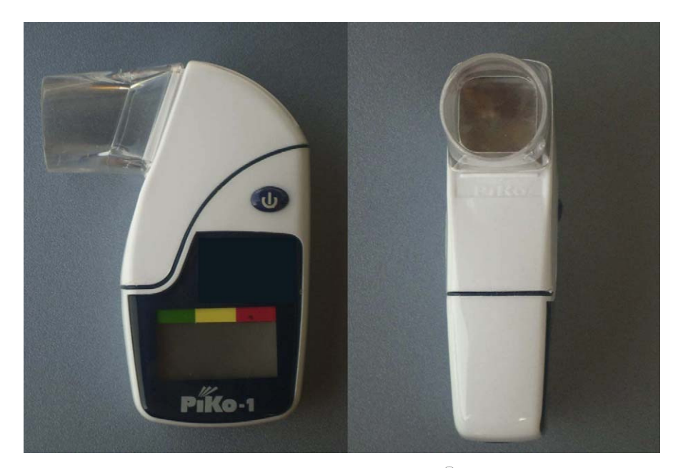
Figure 1 Lateral and front view of the Piko-1<sup>®</sup> portable device.

A descriptive, observational and cross-sectional study was made with randomised selection of 80 asthmatic children between 5-18 years of age seen in the paediatric pneumology clinic, and who were able to correctly perform forced spirometry with a pneumotachograph (Master Screen Jagge<sup>®</sup>) according to ATS/ERS norms,<sup>8</sup> and using the reference values established by Zapletal. After selecting the best of three curves, three measurements were made with the PiKo-1<sup>®</sup>, with selection of the best registry. All patients who correctly completed forced spirometry were also able to correctly complete three manoeuvres with the PiKo-1<sup>®</sup>. The time elapsed between the two tests was less than three minutes, and in all cases forced spirometry was performed first, in order not to affect the results of the test which would serve to determine our criteria in each individual patient.